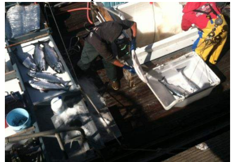
Landings of 2015 commercially caught salmon were less than hoped for in San Francisco

federally protected winter run salmon in 2014 prompted the state to insist on shorter fishing seasons for both commercial and sport salmon fishing this year. Concern for the surviving 2014 winter run out in the ocean is likely to result in a few more restrictions than we experienced in 2015. The reason; the survivors will be jacks in 2016 and big enough to get hooked. In 2015 sport fishermen lost eight days of fishing due to concern for winter run numbers. Commercial trollers lost trolling grounds below Pt. Sur and later below Pigeon Point. A steady increase in restrictions could become the norm for the next several years if the number of winter run dip. ■