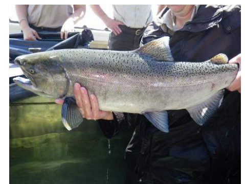
Winter run salmon taken for captive breeding

cooler than normal weather in the northern Sacramento Valley in the fall months to come. ■