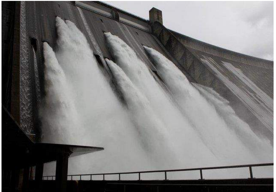
Large flood control releases from Shasta