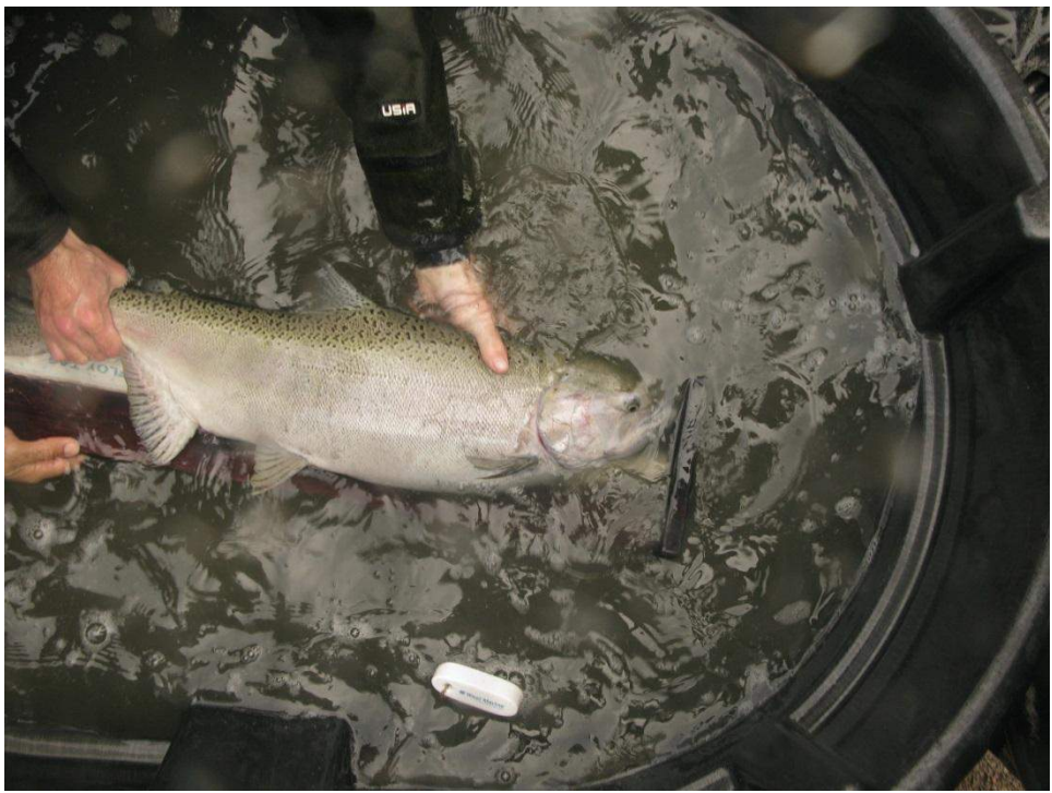
Winter run salmon taken for captive breeding

Due to the drought, state and federal hatchery managers once again trapped and bred as many winter run salmon as they could this More irreplaceable genetics vear. from the small population of winter run salmon would have otherwise likely been lost due to hot river In 2014, instead of conditions. producing the customary 200,000 baby salmon, they produced over 600,000. This year's egg take looks like it will produce only about 400,000. GGSA applauds these efforts at the Livingston Stone Fish Hatchery located at the base of Shasta Dam.