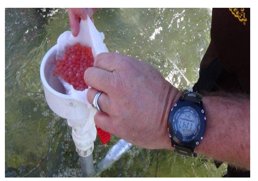
Precious cargo. Five hundred fertilized salmon eggs ready to go into the gravel.