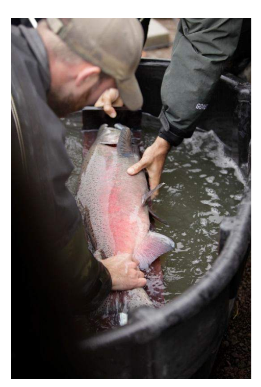
State CDFW rescue adult salmon from Yolo Bypass ag drainage canal in 2014

rebuilding plan in 2013. Since completion of the project, state officials are promising they'll next fix a bigger related problem of adult salmon getting lost and killed in a neighboring ag drainage to the south in the Yolo bypass, just west of Sacramento. This is believed to be the major entry way 600 winter run traveled in 2013, resulting in their failure to spawn that year. Caltrout has been working with local rice growers and state officials for years to design a fix there. GGSA will continue to lend support to fixing this problem. Hopefully a new address momentum to the relatively easy structural solution has emerged in the wake of the rebuilding of the Knights Landing Outfall Gates.