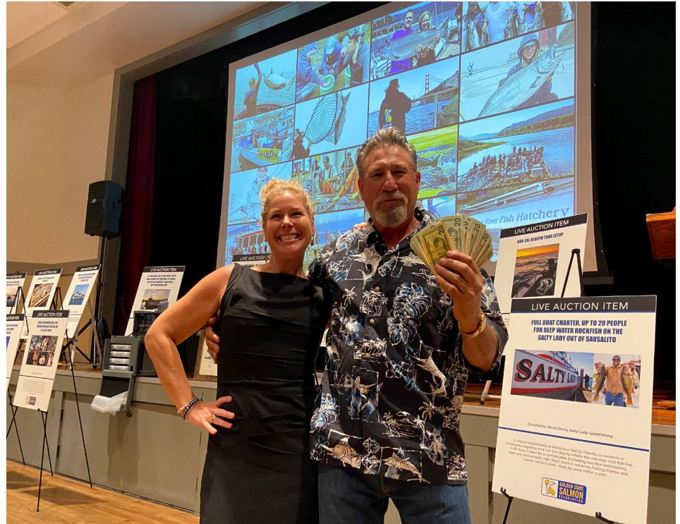
The annual Santa Rosa Dinner is always full of big smiles and big wins!

This dinner is more than a celebration. It brings together those who care deeply about salmon and the communities that depend on them, and offers a chance to stand united and make a difference.